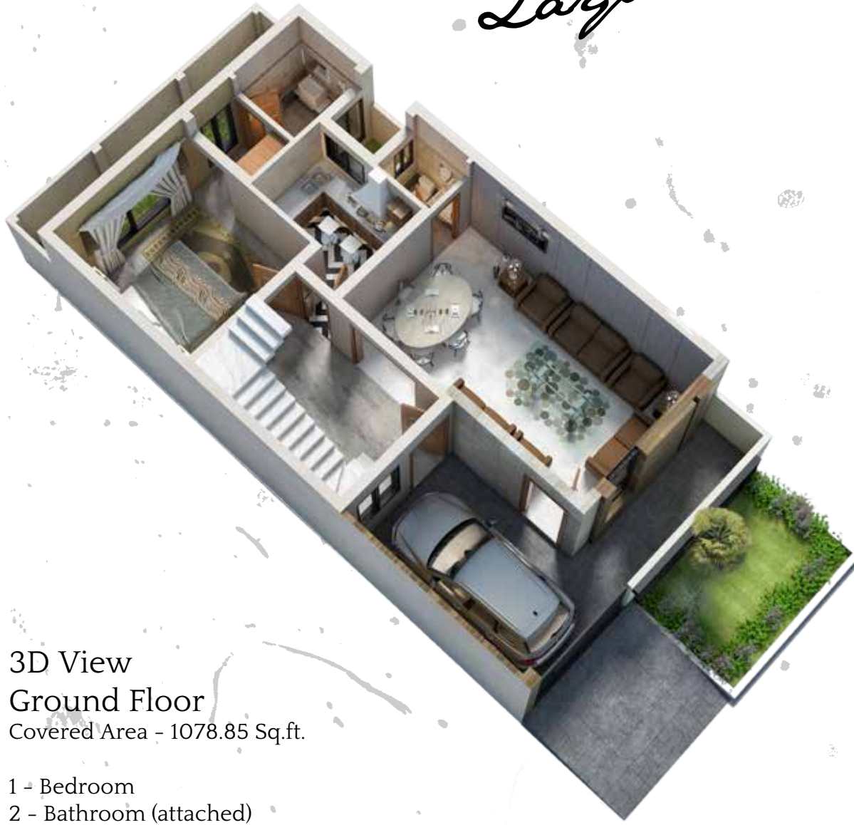
3D View Ground Floor Covered Area - 1078.85 Sq.ft.