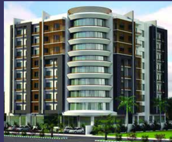
Lucky Lake View Heights, Bani Gala, Islamabad