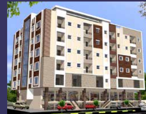
B-Square, B-17, Islamabad