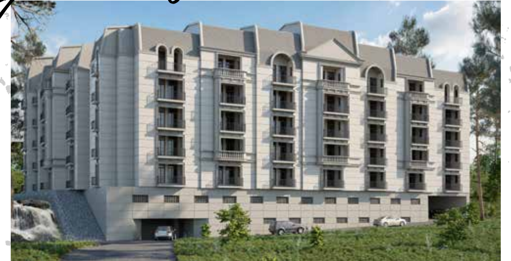
Upcoming Project in Murree