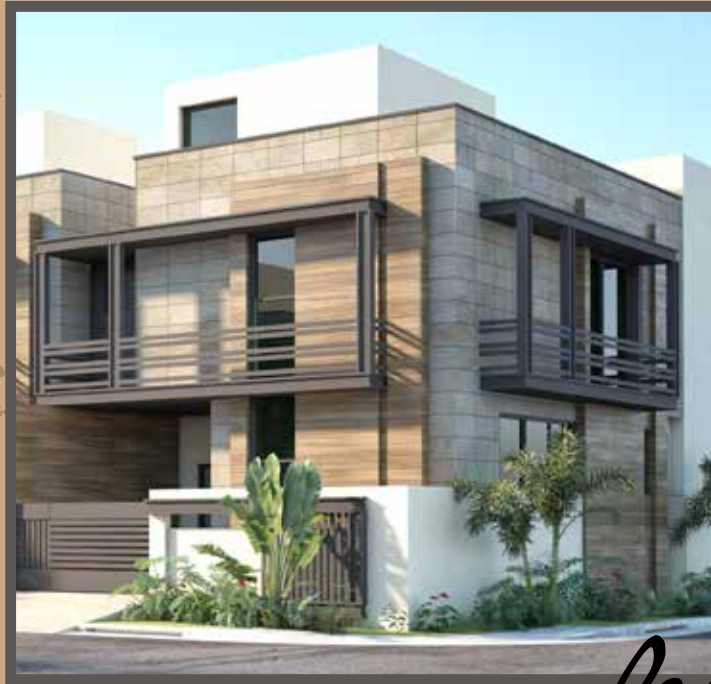
Dream Oaks Villas