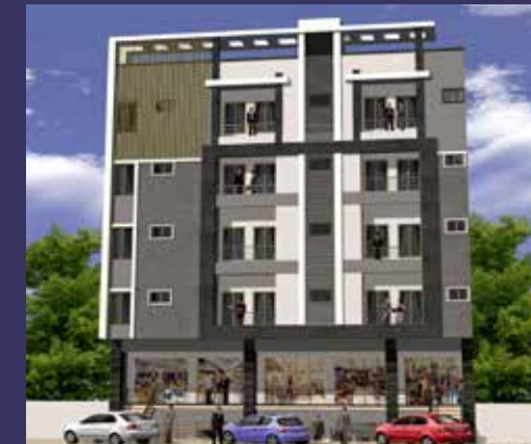
Khushbakht Arcade, B-17, Islamabad