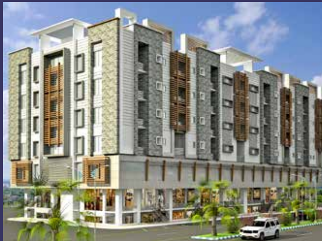
Dream Oaks Arcade, B-17, Islamabad