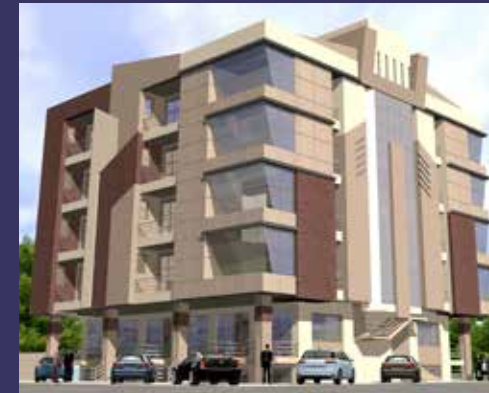
Khushbakht Arcade 1, B-17, Islamabad