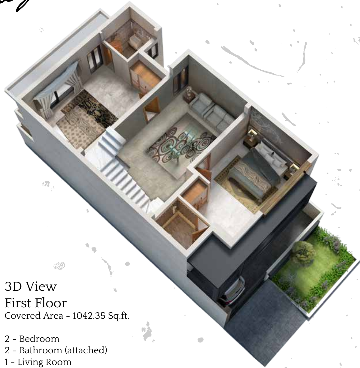
3D View First Floor Covered Area - 1042.35 Sq.ft.