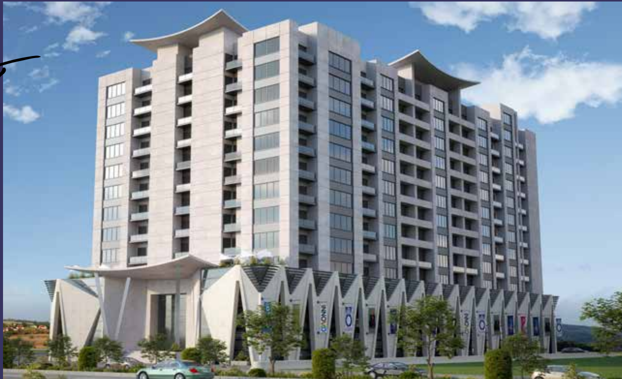
Dream Oaks Heights, Faisal Town