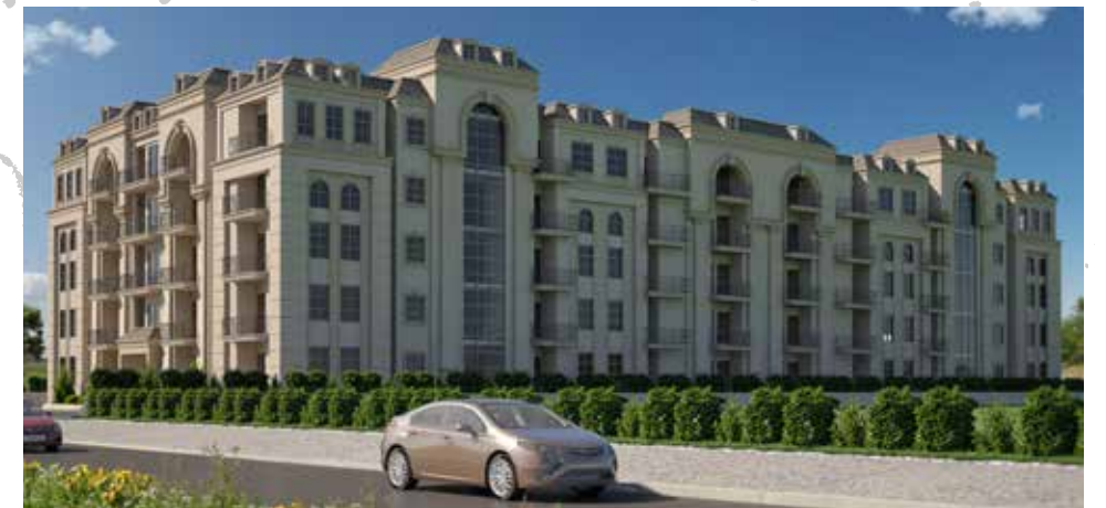
Upcoming Project in Mumtaz City, Islamabad